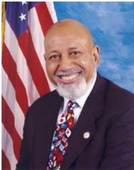
Alcee L. Hastings Congressman Florida's 20th District

Congressman Alcee Hastings was first elected in 1992 as the first African-American from Florida since the post-Civil War era. He represents District 20, which includes parts of Broward, Palm Beach, and Hendry Counties. The “Judge”, as he is known, is a distinguished attorney, civil rights activist, judge and currently, a Member of Congress.