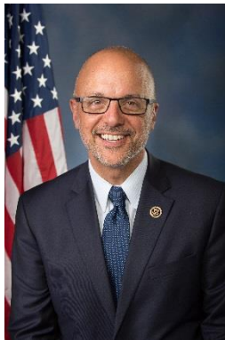
Ted Deutch Congressman Florida's 21 st District

Congressman Hastings graduated from Fisk University in 1958. He earned his law degree from Florida A&M University in Tallahassee.